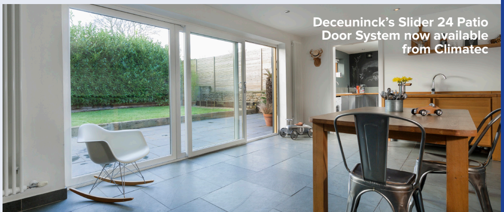
Deceuninck's Slider 24 Patio Door System now available from Climatec

also... New Accreditations / Solidor Product Update / New Window Handles